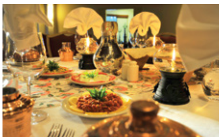
A La Turca Spice Bazaar