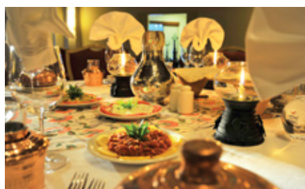
A La Turca Spice Bazaar