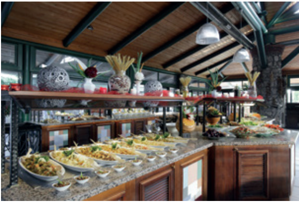
Kapadokya & Terrace Restaurant