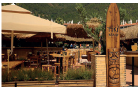
Tiki Beach Restaurant & Bar