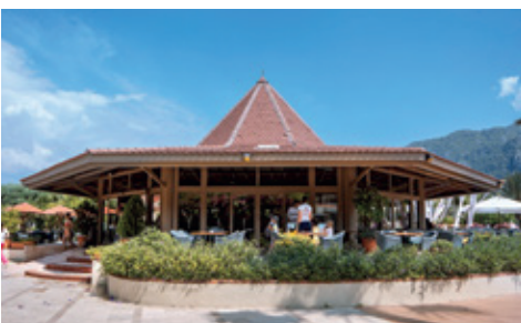
Otag Bar ( Mimoza & Mediterranean Fish Restaurant )